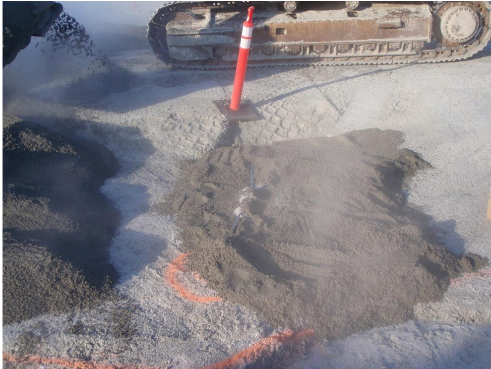
Photo 4: Placement of the last two beads of a horizontal thermistor cable at chainage 1+30