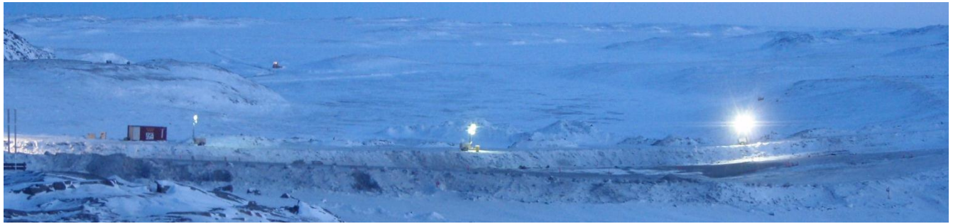
Photo 1: Progress photo of North Dam from photo point 1. ~SSE view