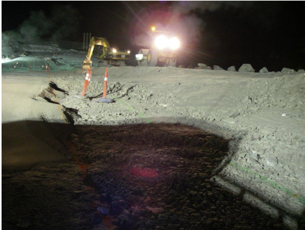
Photo 10: Access point created at Sta1+70. Note the red line along the frozen core marking the crest of the new lift. The core was slightly underbuilt around Sta. 1+75.