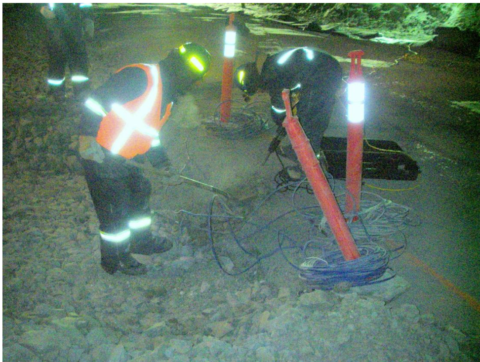
Photo 9: Workers breaking up the frozen core around the thermistor cables at Sta. 1+30.