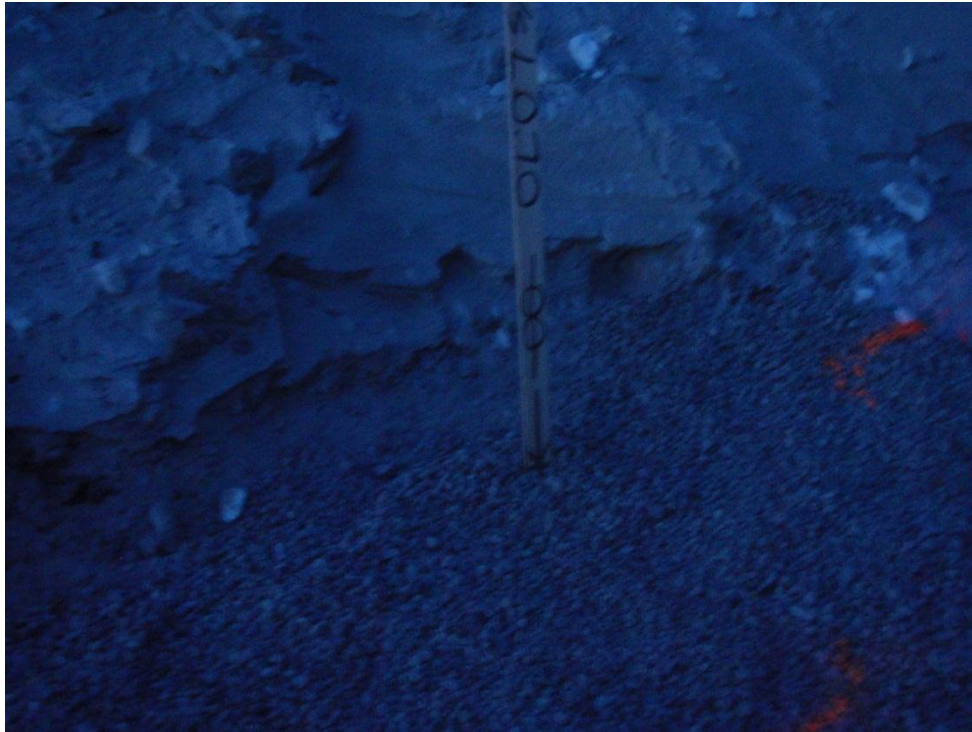
Photo 8: Photo of bentonite tie-in at the base of the Doris North Diversion Berm key-trench