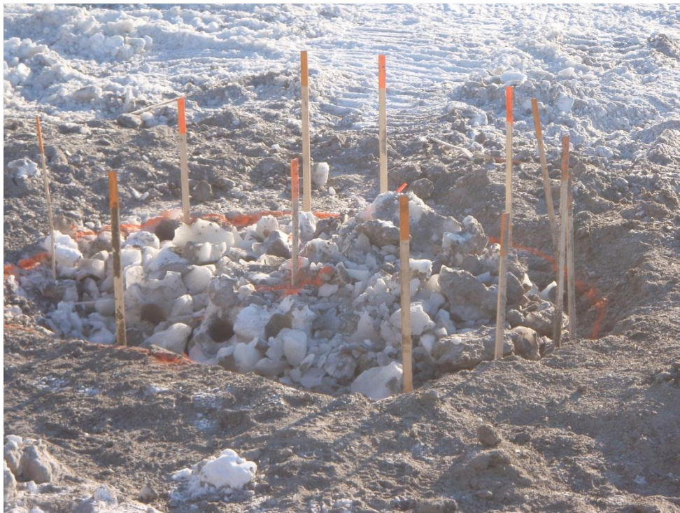
Photo 7: Honeycombed drill pattern at Sump #1; orange survey line represents extends of required excavation