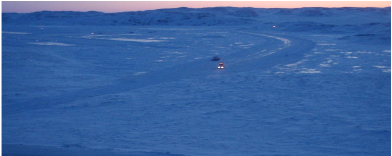
Photo 3: Snow cat pushing snow across Doris Lake for the snow road to the north dam